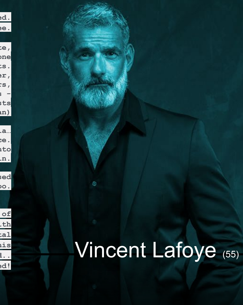
Vincent Lafoye (55)

Now confined to a wheelchair, Vincent uses his "art of the deal" to find ways to improve his declining health and still find joy in two places: ruling LaFoye Capital with an iron fist, and enjoying the company of his secret grandchild, Calista. Where Vicky disappointed.. maybe Calista would, one day, succeed!